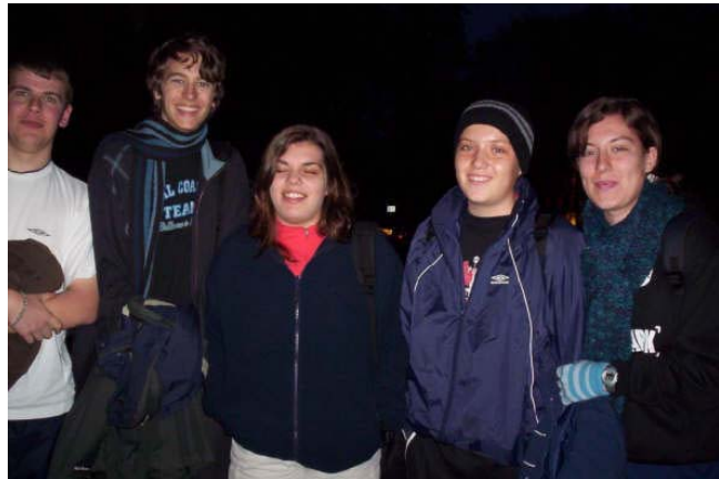
Members of BDYA at Shadow 2006